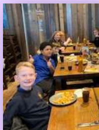
Pupil Leaders Christmas Meal at Nandos!

engaging in a special workshop which will be delivered by a professional from the Children's Commission of Wales in January. This is to raise awareness of young people's rights and responsibilities.